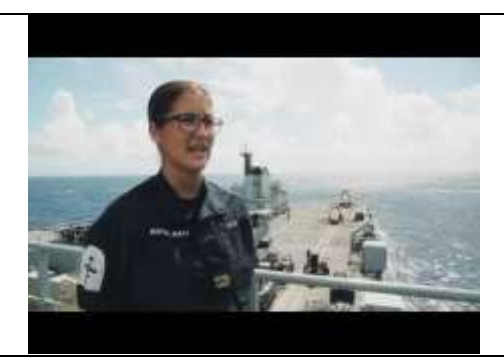
The Royal Navy