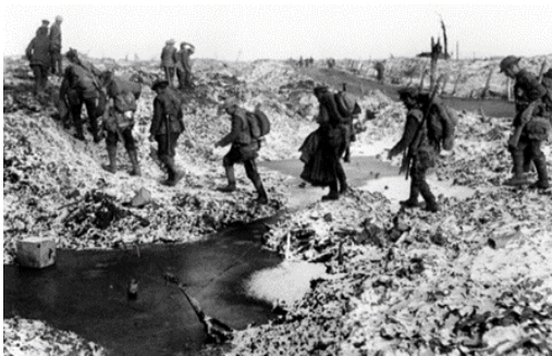
Year 9 The Great War 1914-1918