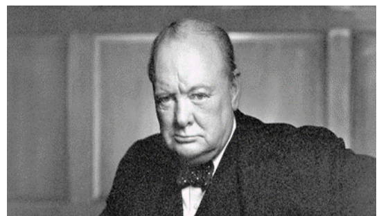
Year 12 Churchill 1929-1951