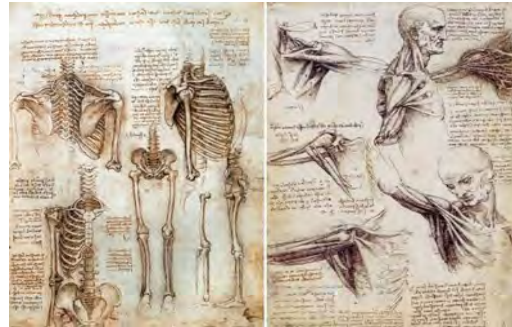
Year 10 Medicine c1250-present day