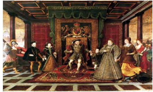
Year 8 The Tudors