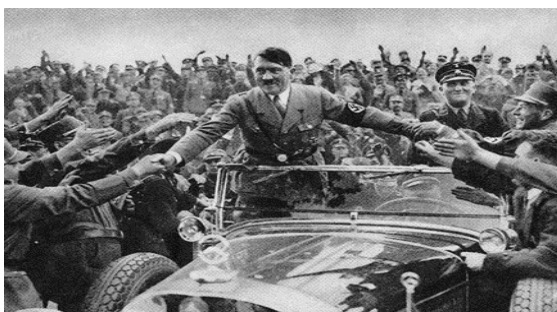
Year 11 The Rise of Hitler & the Nazi's