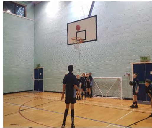
Year 7 & Year 8 Basketball Teams