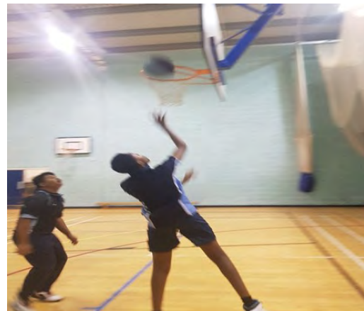
Year 9 & Year 10 Basketball Teams