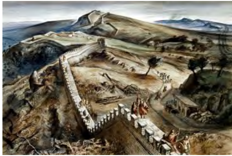
Year 7 The Roman Empire

Below is a selection of the curriculum topics that our students have been focussed on learning this term in the History and Politics Department.