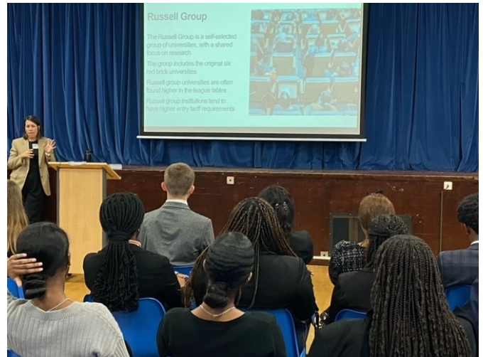
University of Hertfordshire visited to carry out two talks, one on advising the students how to choose their University and university course, the other to give advice on Student Finance.