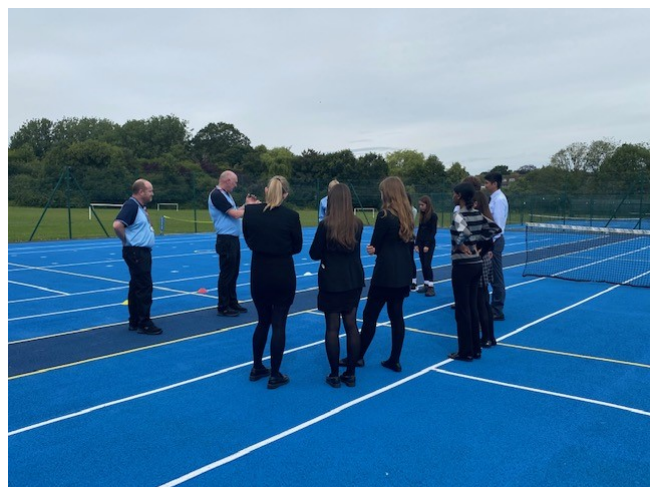
The RAF came in for the day, each form group took it in turns to participate in team building exercises. Year 12's then had a careers talk from the RAF who

discussed all of the careers available and routes into the RAF.