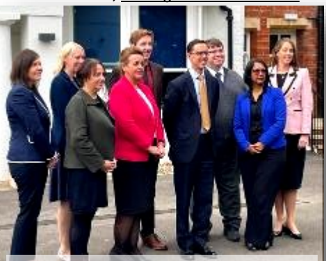
SFACAT Heads met at St. Mary's on Thursday